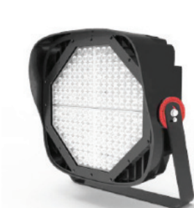
VGS: Visor Glare Shield